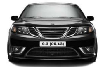
SAAB 9-3 NG (Post Facelift) built between 2006 and 2013

The front grill is integrated into the front bumper with a full width lower grill. The Saab Information Display (SID) is located on top of the dashboard. It is not possible to change the radio in these cars to an aftermarket set.