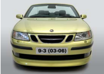
SAAB 9-3 NG (Pre-facelift) built between 2003 and 2006

Convertible models were built until 2003, 3/5 door hatchback production ended in 2002. The front bumper and chrome front grill are separate and headlamp wipers were optional. All models use the 42k-1230-004 steering wheel control interface to change the radio.