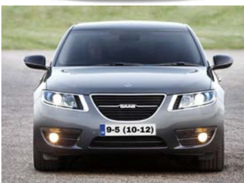
SAAB 9-5 NG built between 2010 and 2012

Models with basic radio use 42ssa001 steering wheel control interface. Models with Denso navigation use 42k-1230-007 on cars with paddle shift gearbox or interface 42k-1230-006 on cars with a paddle shift gearbox.