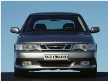
SAAB 9-3 OG built between 1998 and 2003

The easiest way to tell which version you have is to check the year and the front of the car as they are all distinctively different.