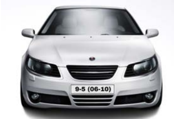
SAAB 9-5 OG (Facelift 2) built between October 2006 and 2010

The SID has 8 trip computer functions. Some late models come with optional Denso Satnav. All models use 42k-1230-005 steering wheel control interface.