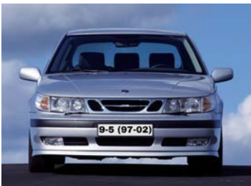
SAAB 9-5 OG (Pre-Facelift) built between 1997 and May 2002

All models use 42ssa001 steering wheel control interface to change the radio.